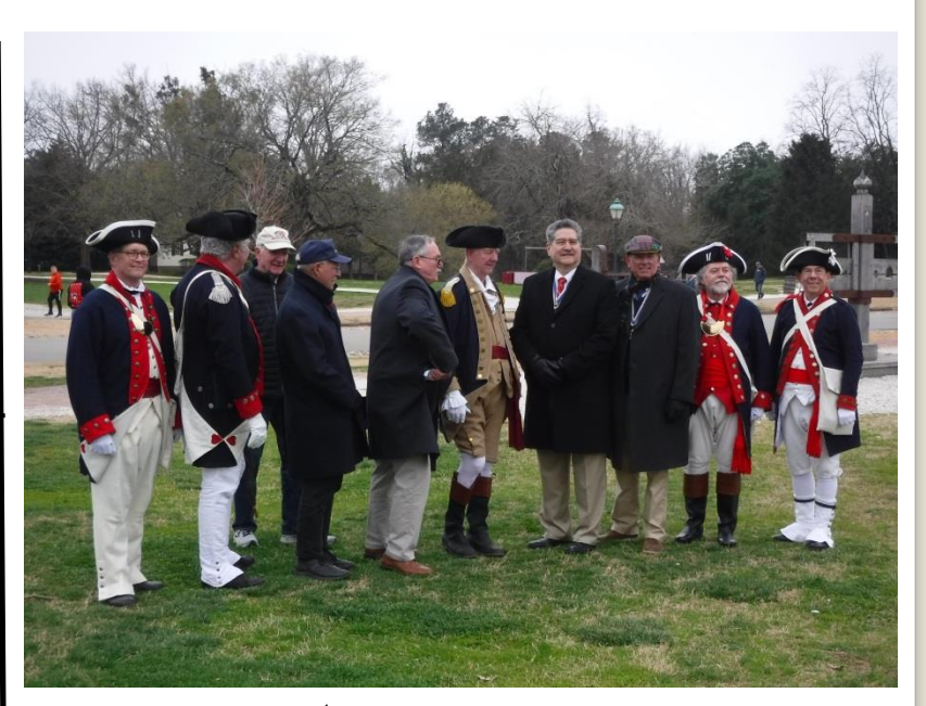
Sunday, March 12<sup>th</sup> trying to stay warm while waiting for the 250th Commemoration of the 1773 Virginia Committee of Correspondence event being held at The Raleigh Tavern.