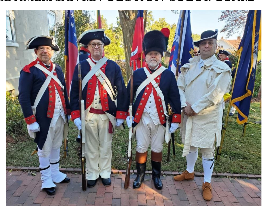
and our COLOR GUARD