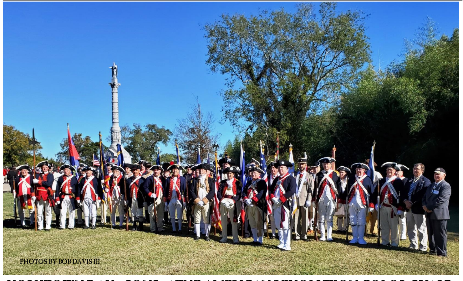
YORKTOWN DAY - SONS of THE AMERICAN REVOLUTION COLOR GUARD