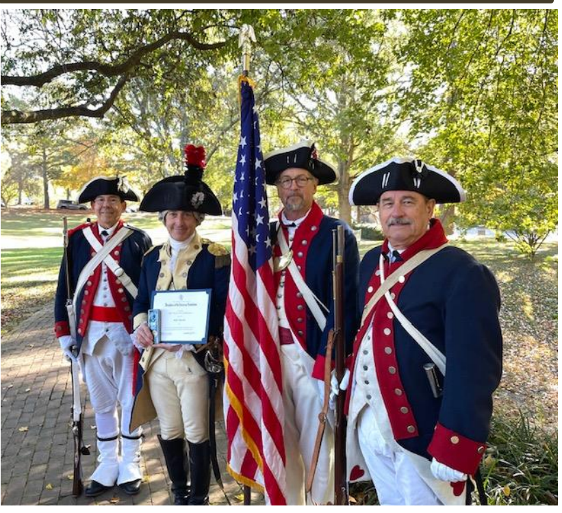
3 November DAR 250th Marker Dedication