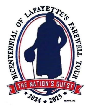
The American Friends of Lafayette is the proud official sponsor of the commemoration of Lafayette's Farewell Tour.

Bicentennial of Lafayette's Farewell Tour 2024–2025