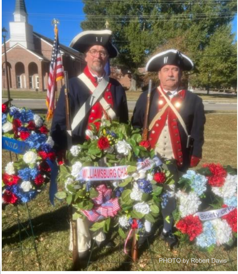
4 November Kemps Landing Commemoration