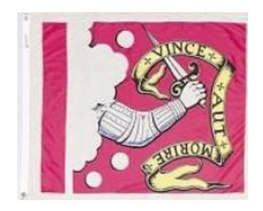
Bedford Flag

The oldest known American Battle flag, this banner was flown by the Bedford Minutemen Company at the Battle of Lexington and Concord and onward.